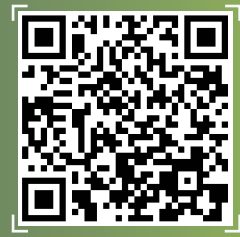
Scan to start a conversation